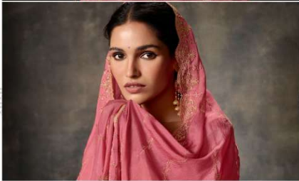
The art of being graceful D.NO.14872