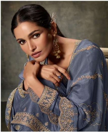
Brighten up your festive mood D.NO.14873