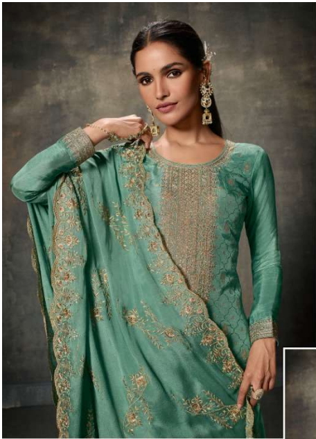
Embrace elegance and poise. D.NO. 14871