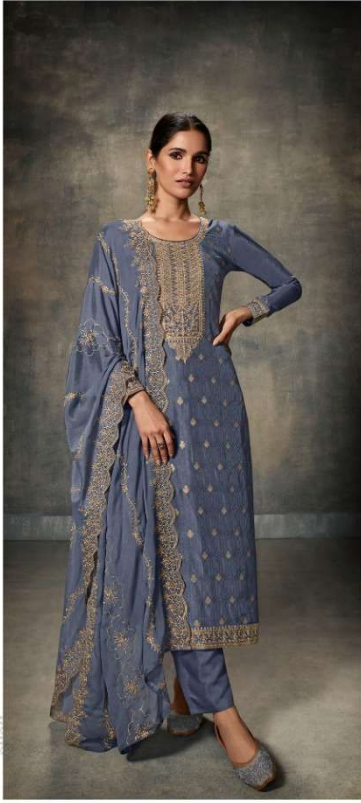
Brighten up your festive mood D.NO.14873