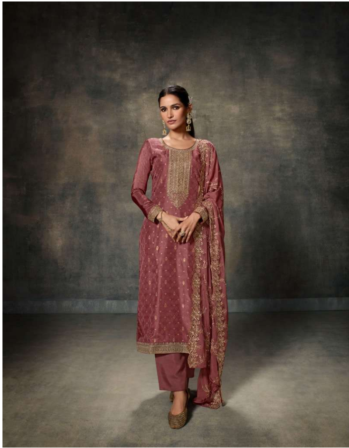
Set your own fashion goals D.NO. 14875