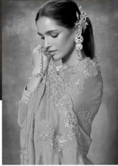
Get ready for summer festivities.