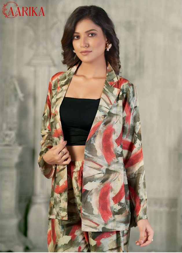
D.No:4913 Fashion you can buy, but style you possess. The key to style is learning who you are, which takes years. There's no how-to road map to style. It's about self-expression and, above all, attitude.