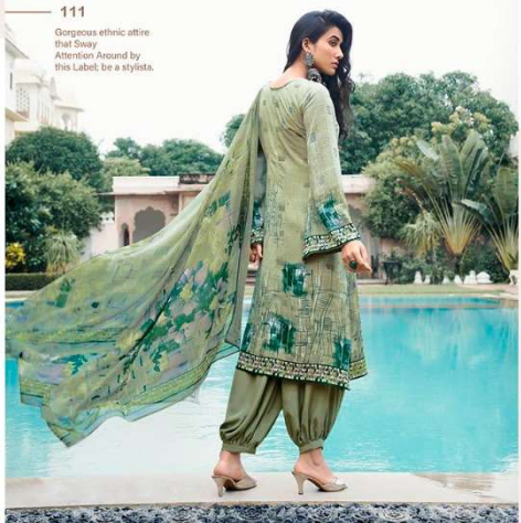
111 Gorgeous ethnic attire that Sway Attention Around by this Label be a stylist.