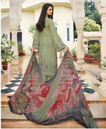
113 Evoke your ethnic ethos with this beautifully crafted attire with embroidery details and jacquard dupatta.