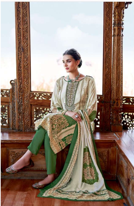
Nourishing unbelievable Crafts with freshness in styling for Perfect charming appearance of you. This splendid piece of fusion, perfectly immaculate your personality.