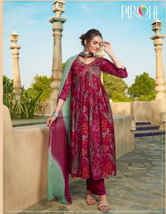
D.No - 1002