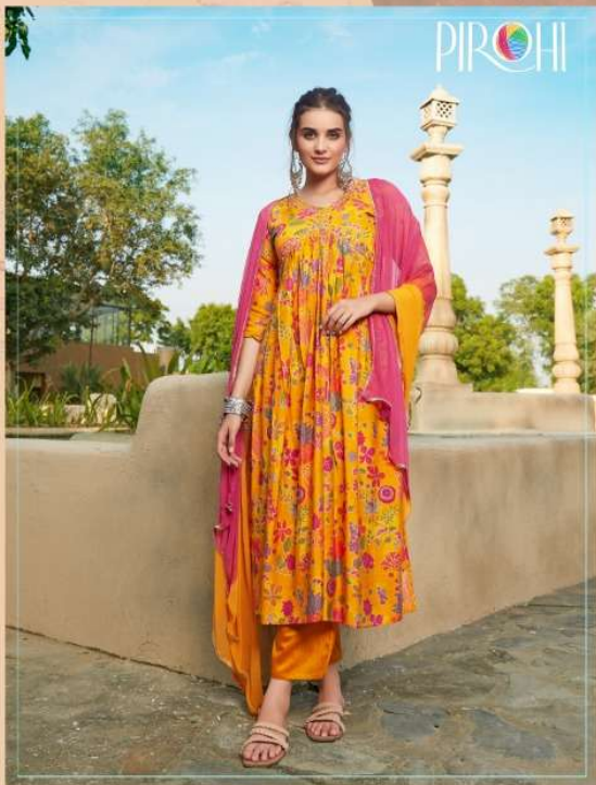
D.No - 1003