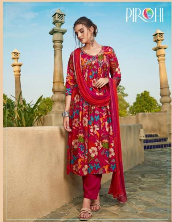
D.No - 1004