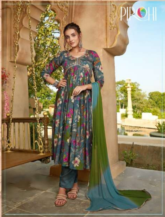
D.No - 1001