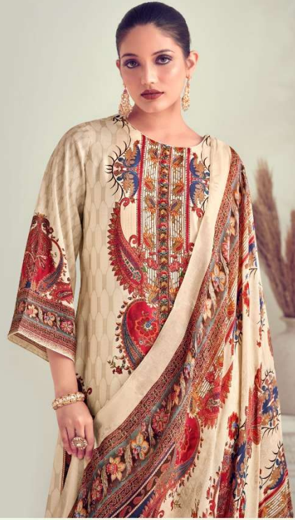
LOOK | 1505

STIMAR® S. MARANGONI Via S. Felice 10, 37060 Marostica (VI) Italy