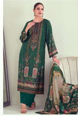
LOOK | 1508