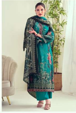
LOOK | 1504