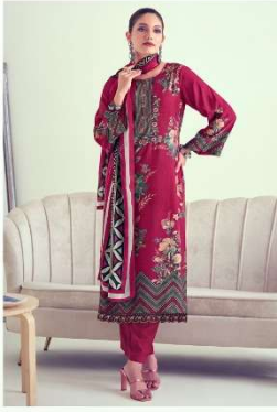
LOOK | 1503