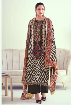
LOOK | 1506