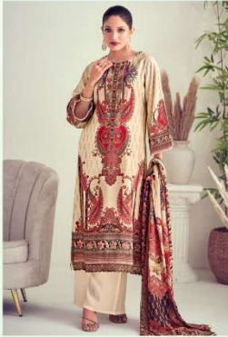
LOOK | 1505