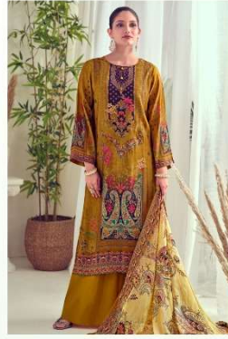
LOOK | 1507