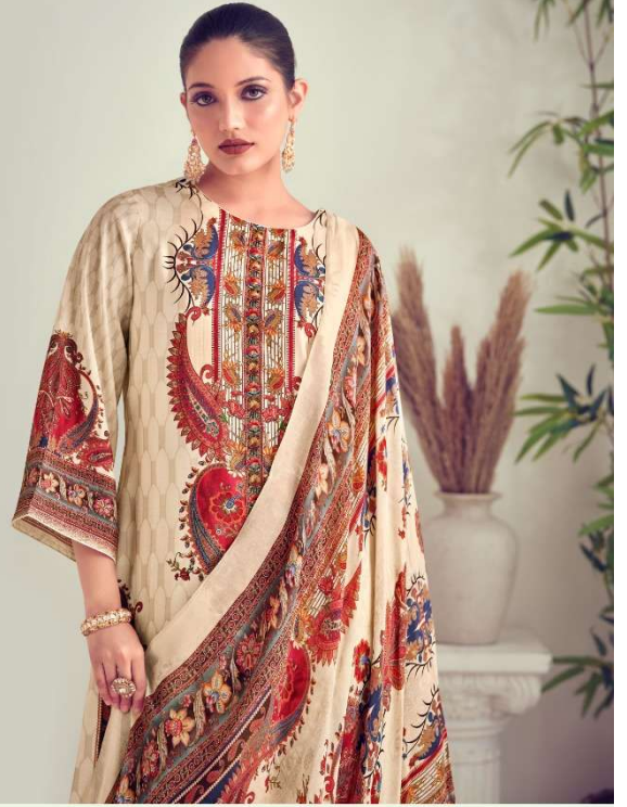
LOOK | 1505