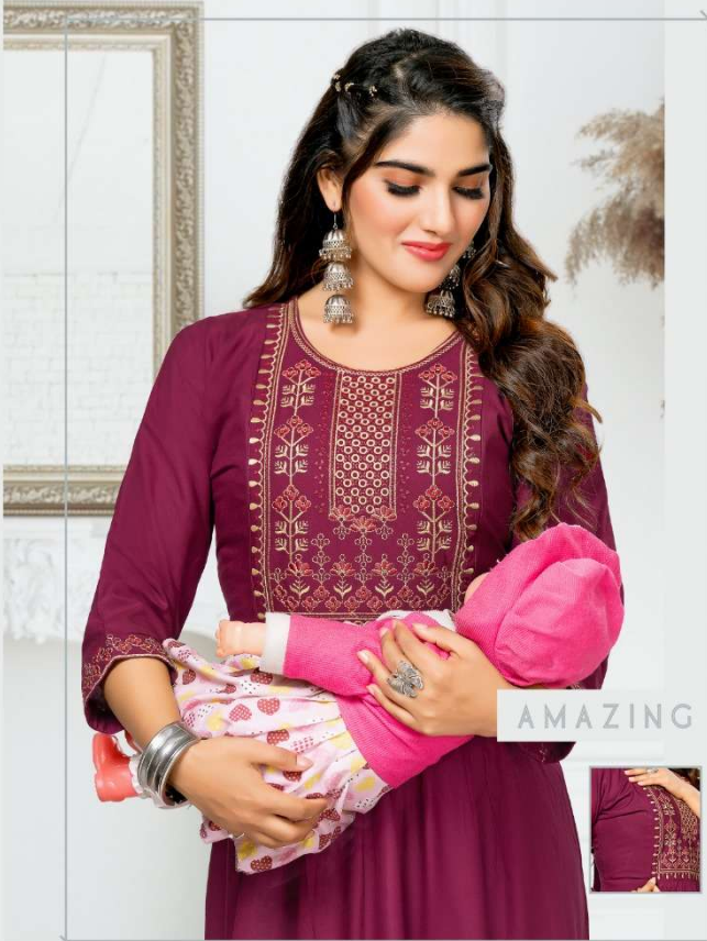
there's a new mood for women and it's full of sophistication glamour and seductive womanly charm