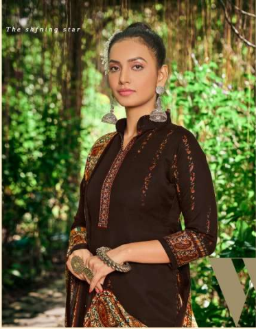
Threr she is the evening star, she shines first she shines brightest, and she shines longest