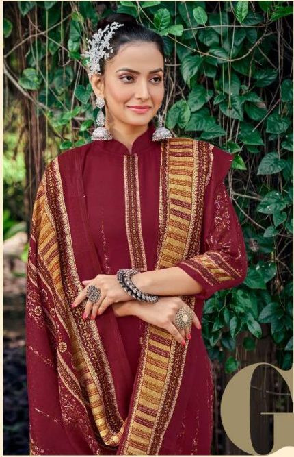
Embrace your love for private whether you mix & match or go head-to-toe, just remember there are no rules.