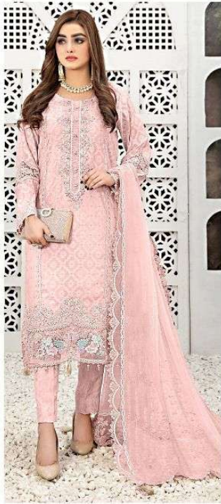
C - 1361