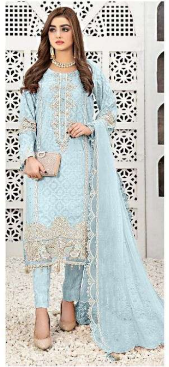
C - 1361 D