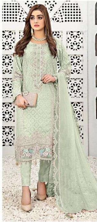
C - 1361 B