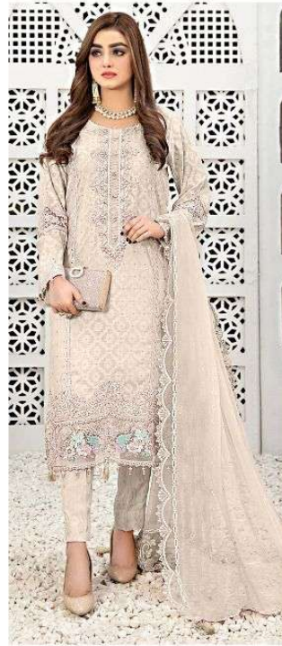
C - 1361 C