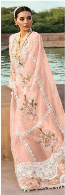
D.NO. 196 A