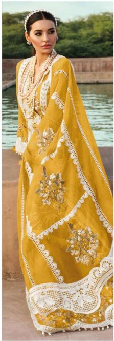
D.NO. 196 F