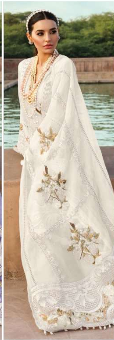
D.NO. 196 E