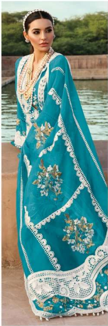
D.NO. 196 H