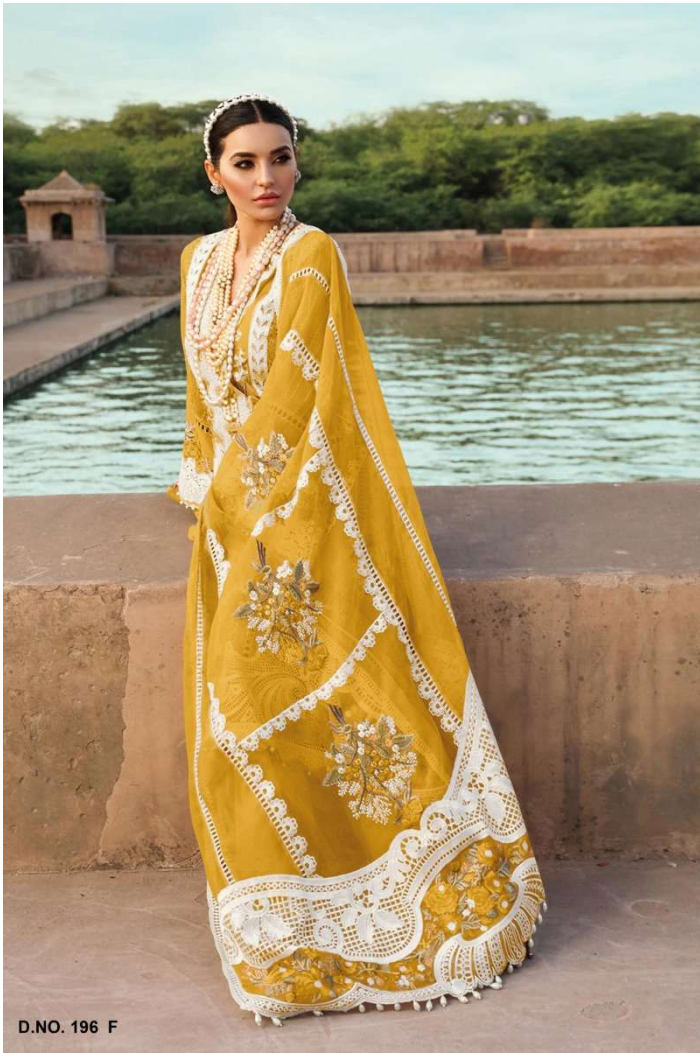
D.NO. 196 F