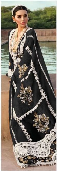
D.NO. 196 B