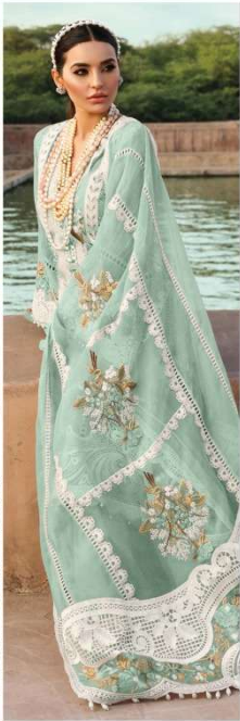
D.NO. 196 C