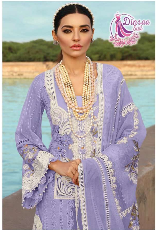
D.NO. 196 D