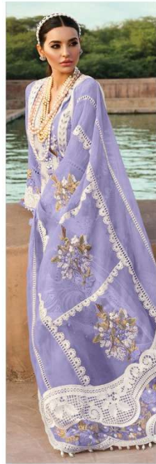
D.NO. 196 D