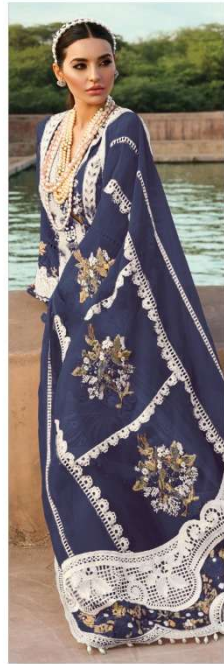
D.NO. 196 I