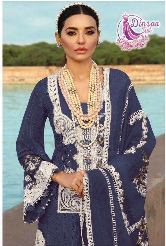
D.NO. 196 I