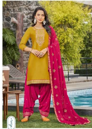
DESIGN NUMBER 13893