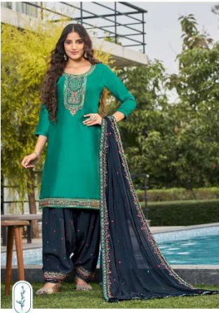
DESIGN NUMBER 13889