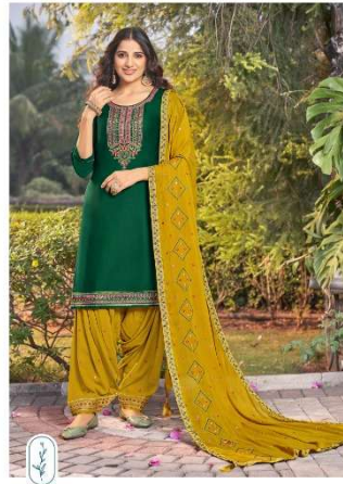
DESIGN NUMBER 13891