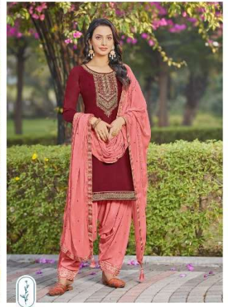
DESIGN NUMBER 13892