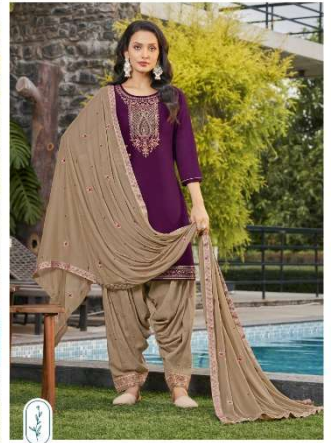
DESIGN NUMBER 13894