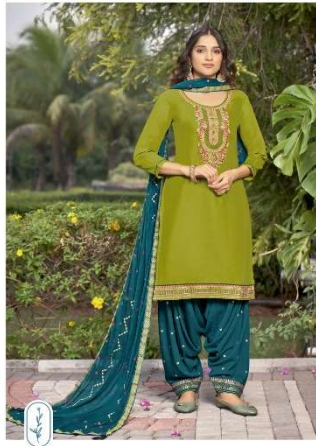
DESIGN NUMBER 13890