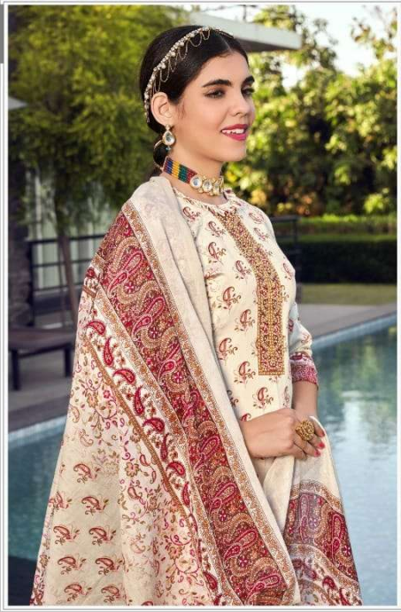
TRADITIONAL LOOK Decorate the beauty of your love towards 1006