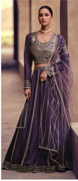
CODE - 5394