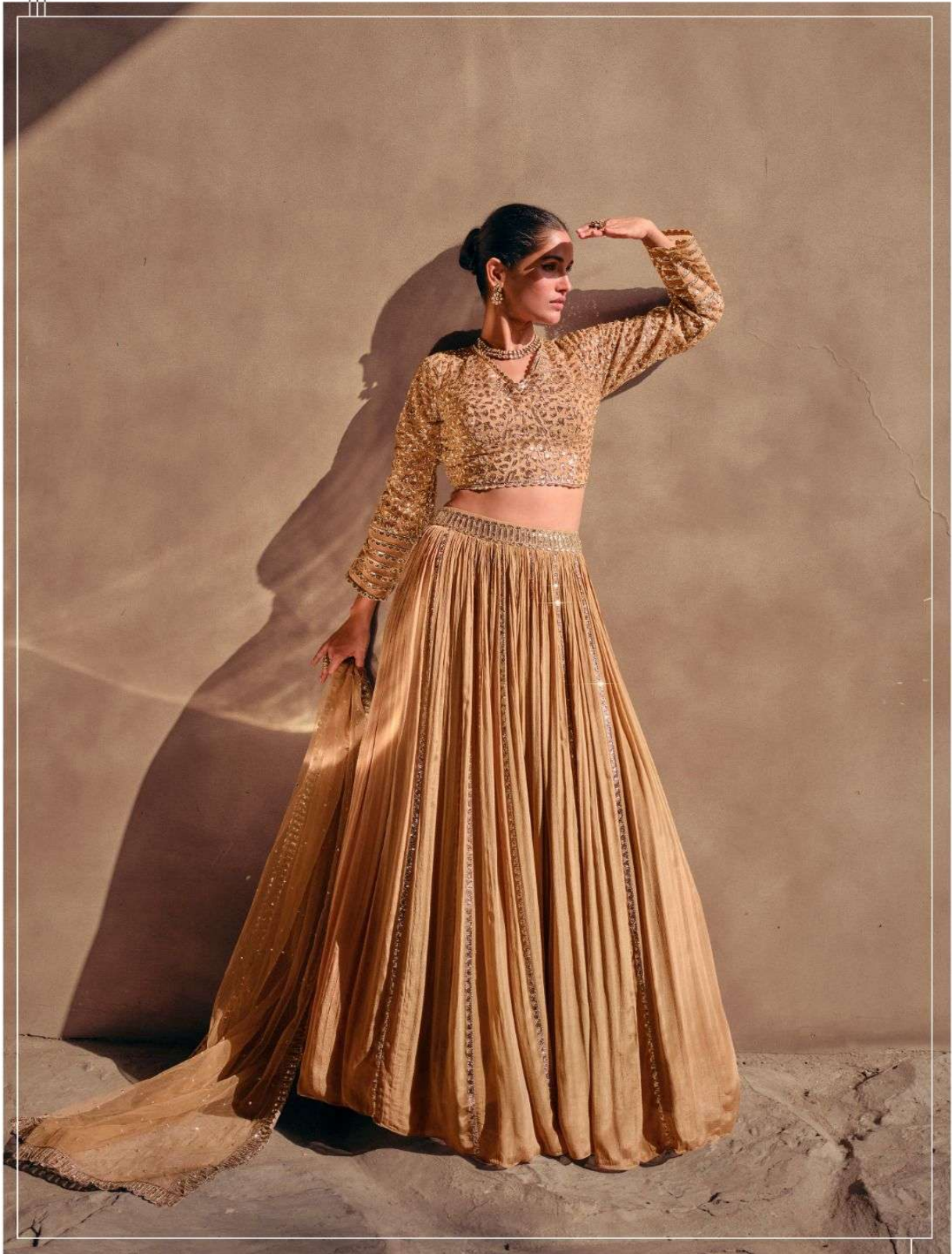
The designs were multi utility & we could see a few outfits that we could wear up with other everyday .....