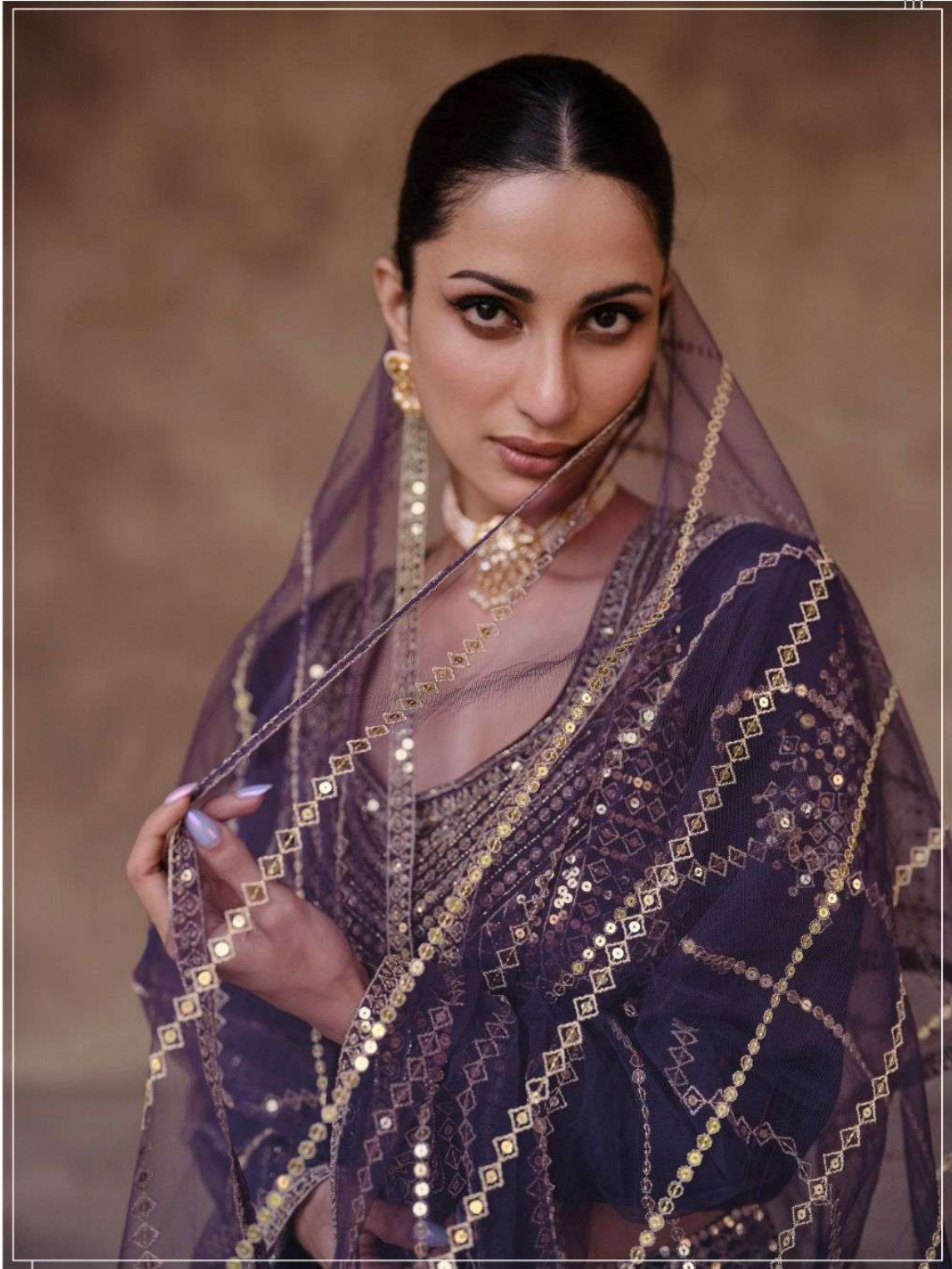
A breath taking array of fine detailing & intricate design inspired by Indian culture ..... CODE - 5394