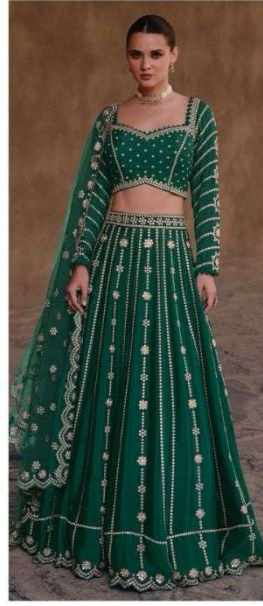
CODE - 5396