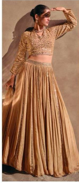
CODE - 5395