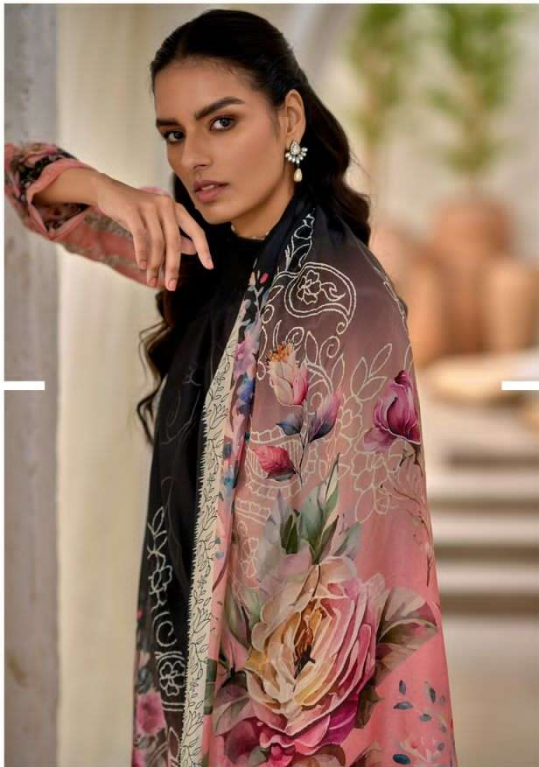
OUTFITS THAT WILL MAKE YOU COMFORTABLY BEAUTIFUL