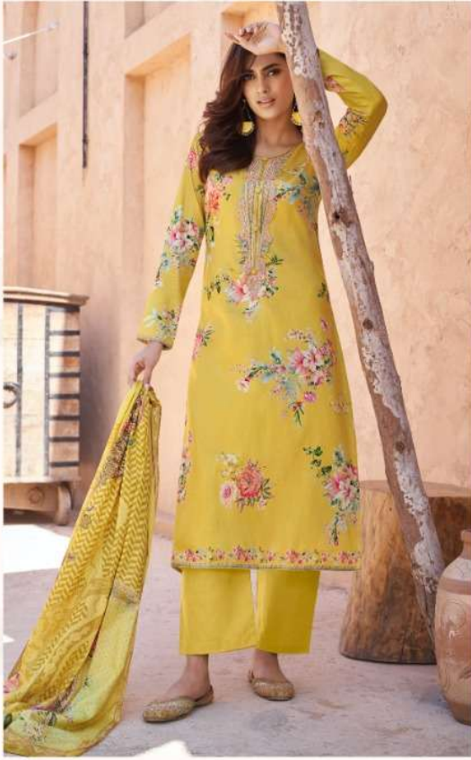
D NO :- 5001