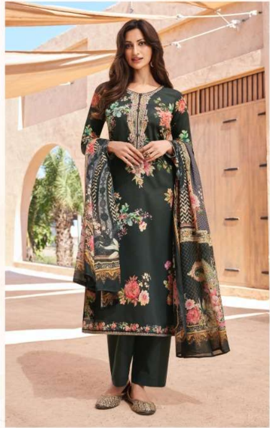
D NO :- 5004