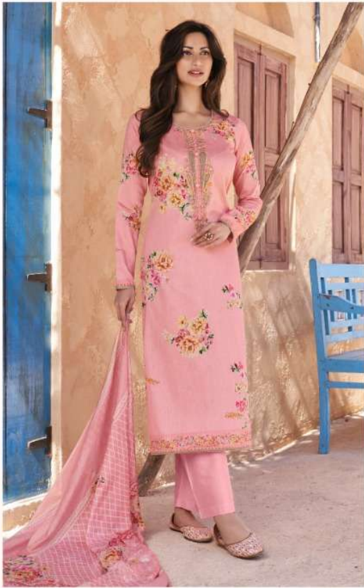
D NO :- 5003