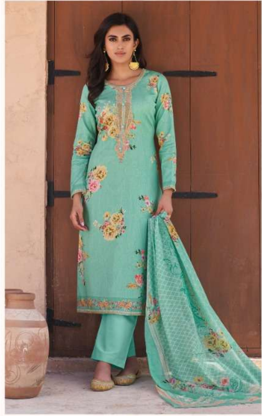
D NO :- 5002