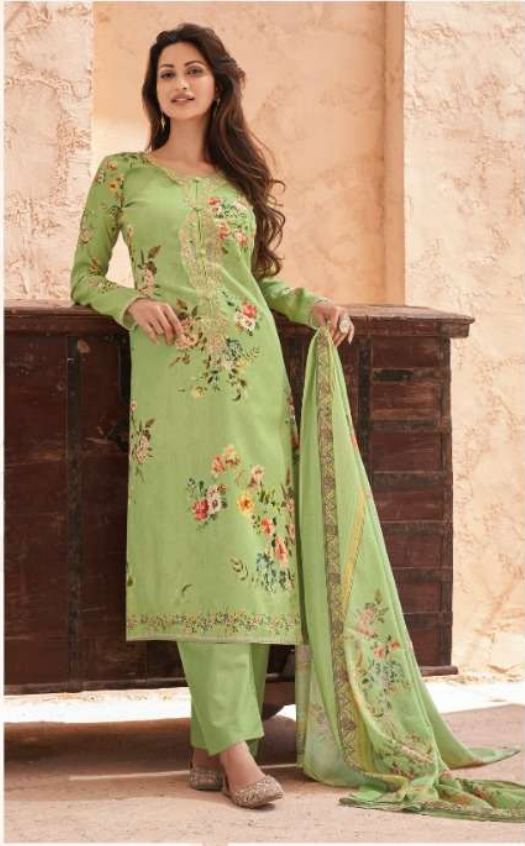
D NO :- 5005