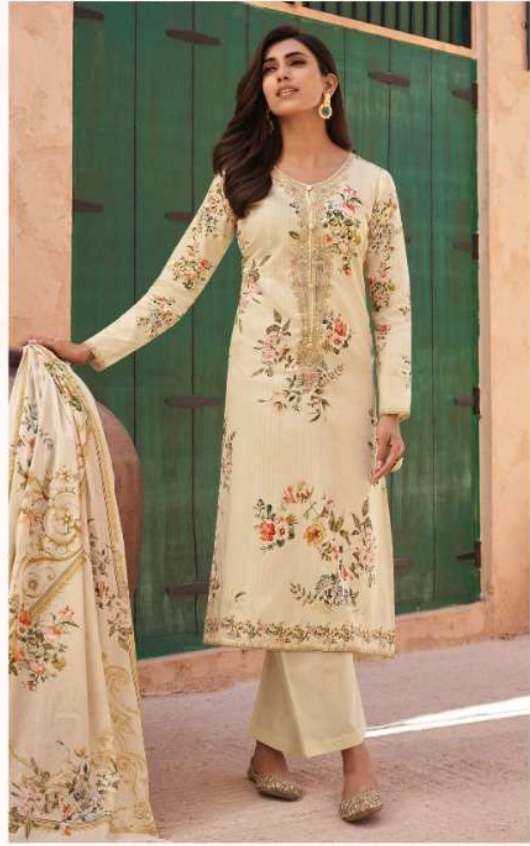
D NO :- 5006