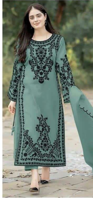
7773 D.No:-247 C