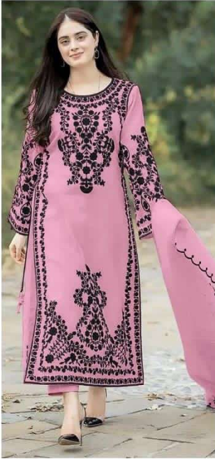
7773 D.No:-247 A

TOP- PURE FOX GEORGETTE WITH HEAVY EMBROIDERY AND SEQUENCE WORK BOTTOMINNER- DULL SHANTOON DUPATTA- PURE GEORGETTE FANCY DUPATTA AND HEAVY EMBROIDERY