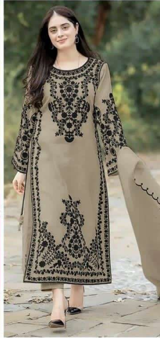
7773 D.No:-247 B