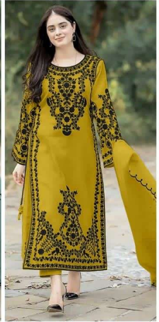
7773 D.No:-247 D