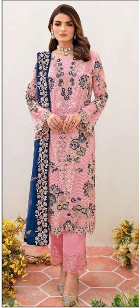
S 252 A

Top - Fox Georgette heavy embroidery work Inner Bottom - Dull santoon Dupatta - Fox Georgette heavy embroidery work