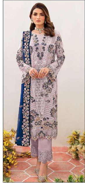
S 252 D