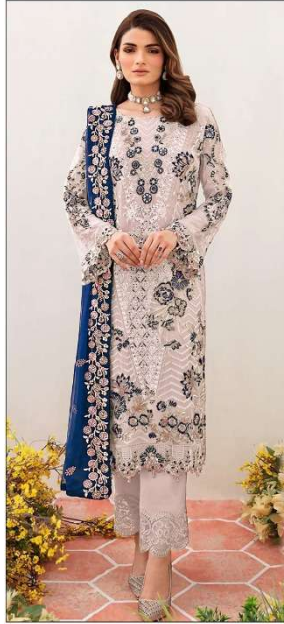
S 252 B