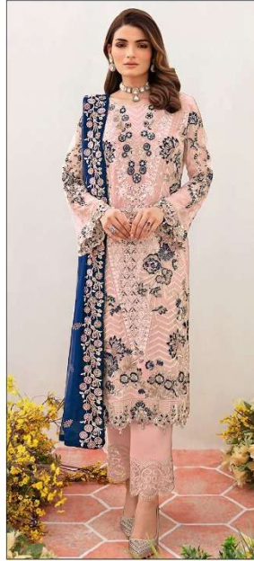
S 252 C