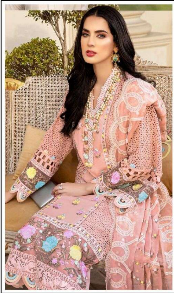
Top: Pure Cotton With Chikankari Work Bottom : Semi Lawn Dupatta : Butterfly Nett With Heavy Embroidery