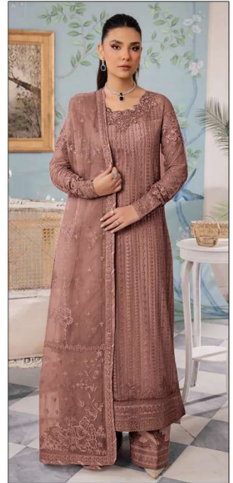
S - 269 D