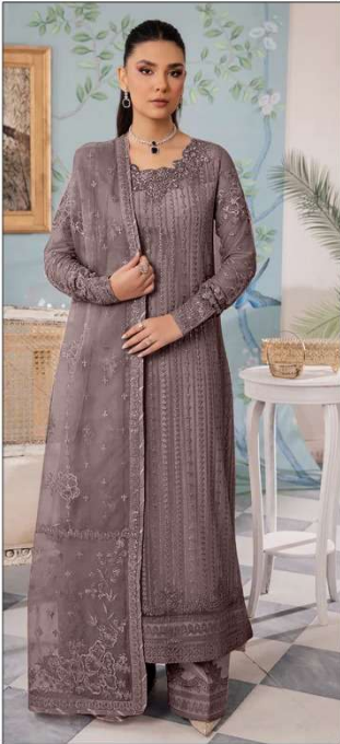
S - 269 A