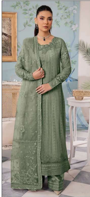
S - 269 C