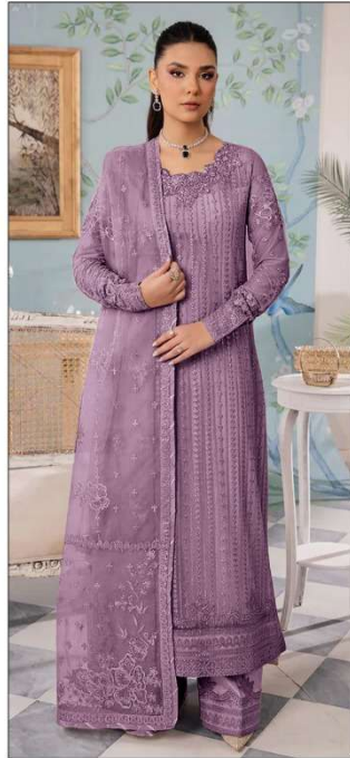
S - 269 B