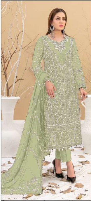
S - 271 A