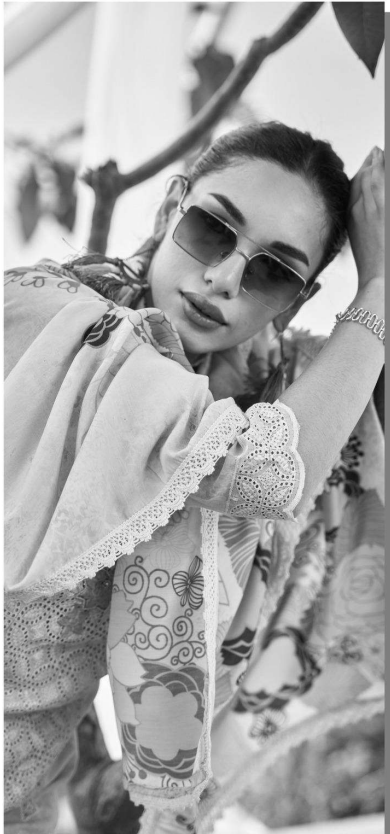
Fashion is almost like a religion, for me atleast. When you love fashion, there is no nweekend. Everything just blenas together. Fashion is about how you place the object on the person.