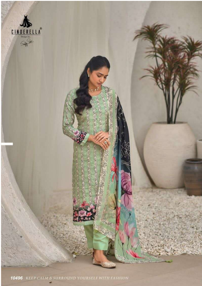
10496 KEEP CALM & SURROUND YOURSELF WITH FASHION