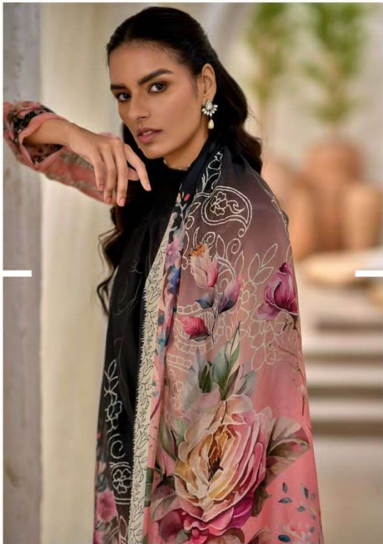
OUTFITS THAT WILL MAKE YOU COMFORTABLY BEAUTIFUL