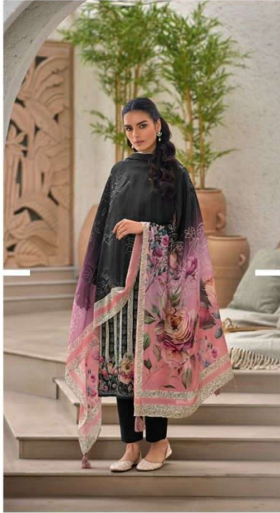
LINKING FASHION WITH RELAXATION