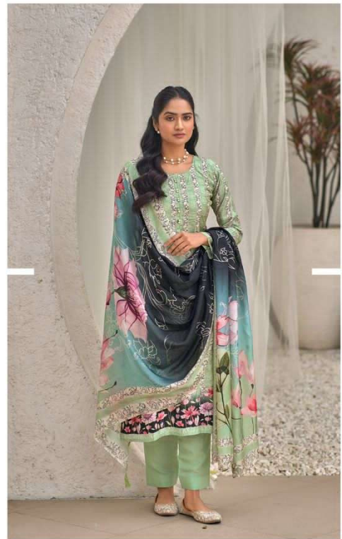
10496 KEEP CALM & SURROUND YOURSELF WITH FASHION