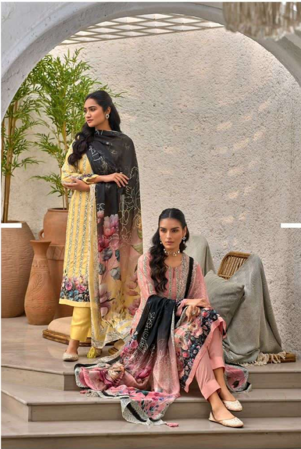
OUTFITS THAT WILL MAKE YOU COMFORTABLY BEAUTIFUL