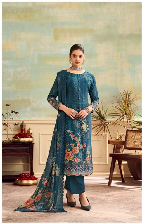
TRADITIONAL HUE GETS A WHOLE NEW LOOK CODE#4002