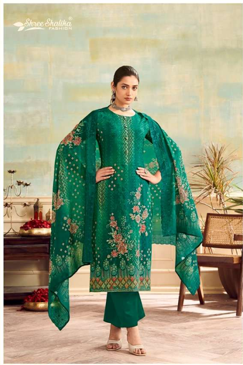
EMBRACE ONE OF THE PUREST TRENDS THIS SEASON CODE#4006