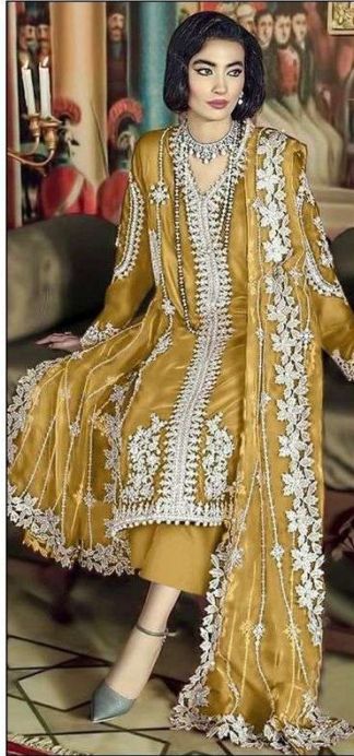
JT D.NO.139 B