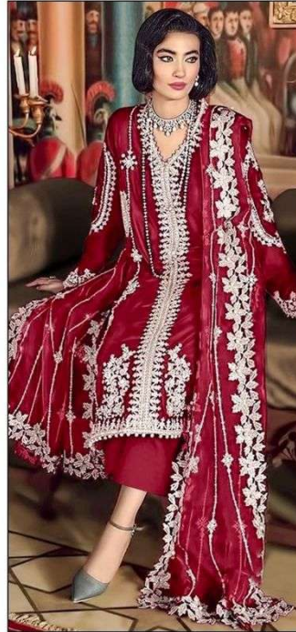
JT D.NO.139 C