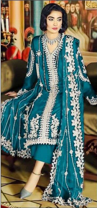
JT D.NO.139 A