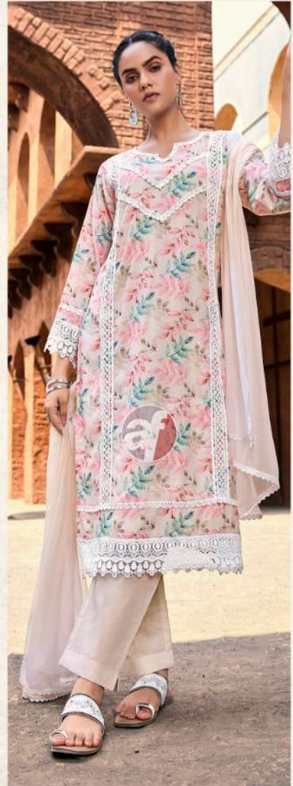
SAKHI RE VOL-2 D.no.3783