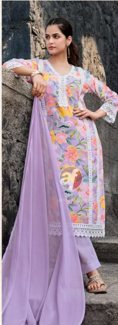
SAKHI RE VOL-2 D.no.3781