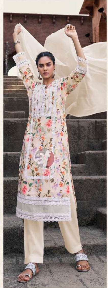
SAKHI RE VOL-2 D.no.3786