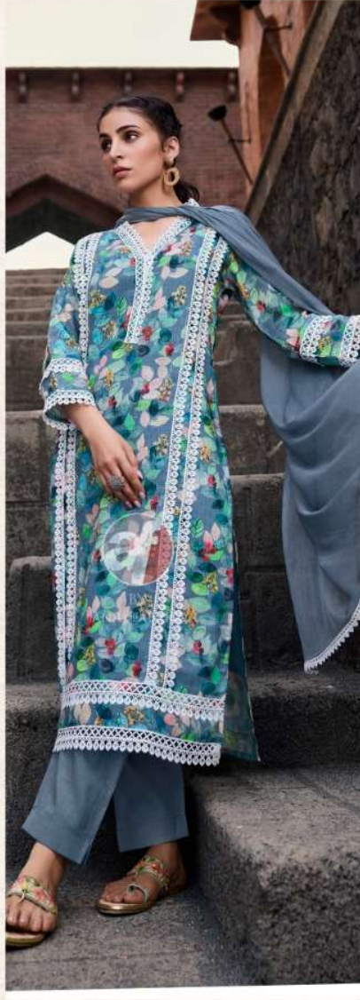
SAKHI RE VOL-2 D.no.3785