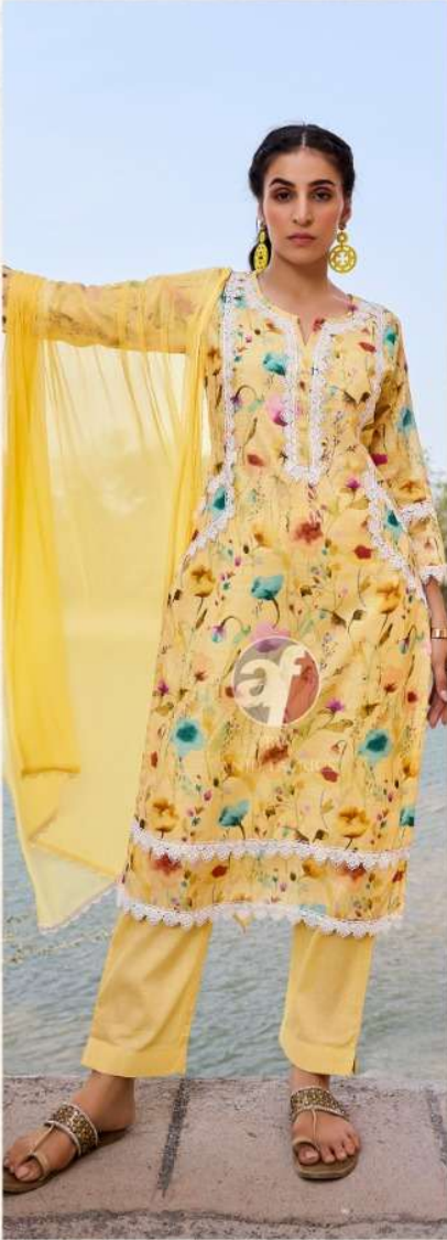
SAKHI RE VOL-2 D.no.3784