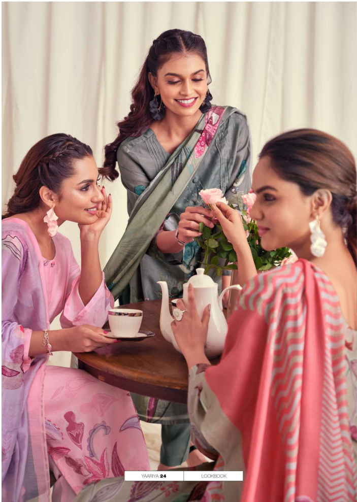
YAIRYA 24 | LOOKBOOK