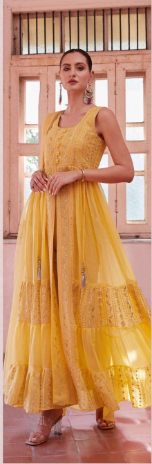
• 6003 •