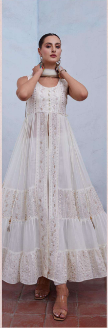
• 6002 •