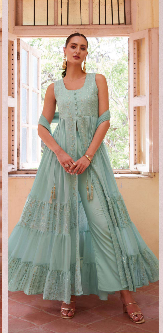
• 6005 •