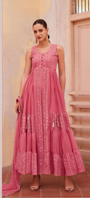
• 6004 •