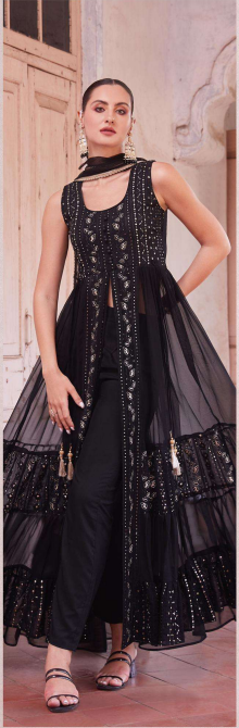
• 6001 •