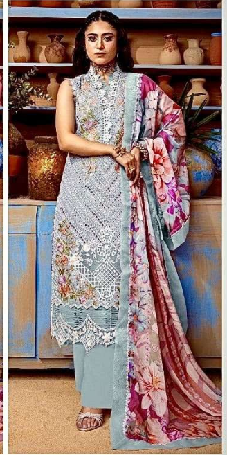
7773 D.No:-463 D