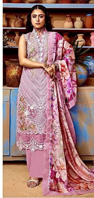
7773 D.No:-463 C