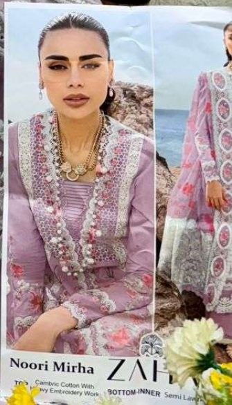
Noori Mirha ZAF TOP: Cambrie Cotton With Heavy Embroidery Work BOTTOM: INNER Semi-Lace