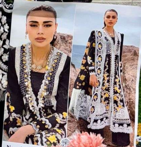
Noori Mirha TOP - Cambria Cotton Weave Heavy Embroidery