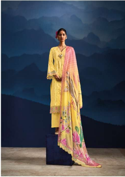
VAADI A HIDE-OUT IN THE HILLS