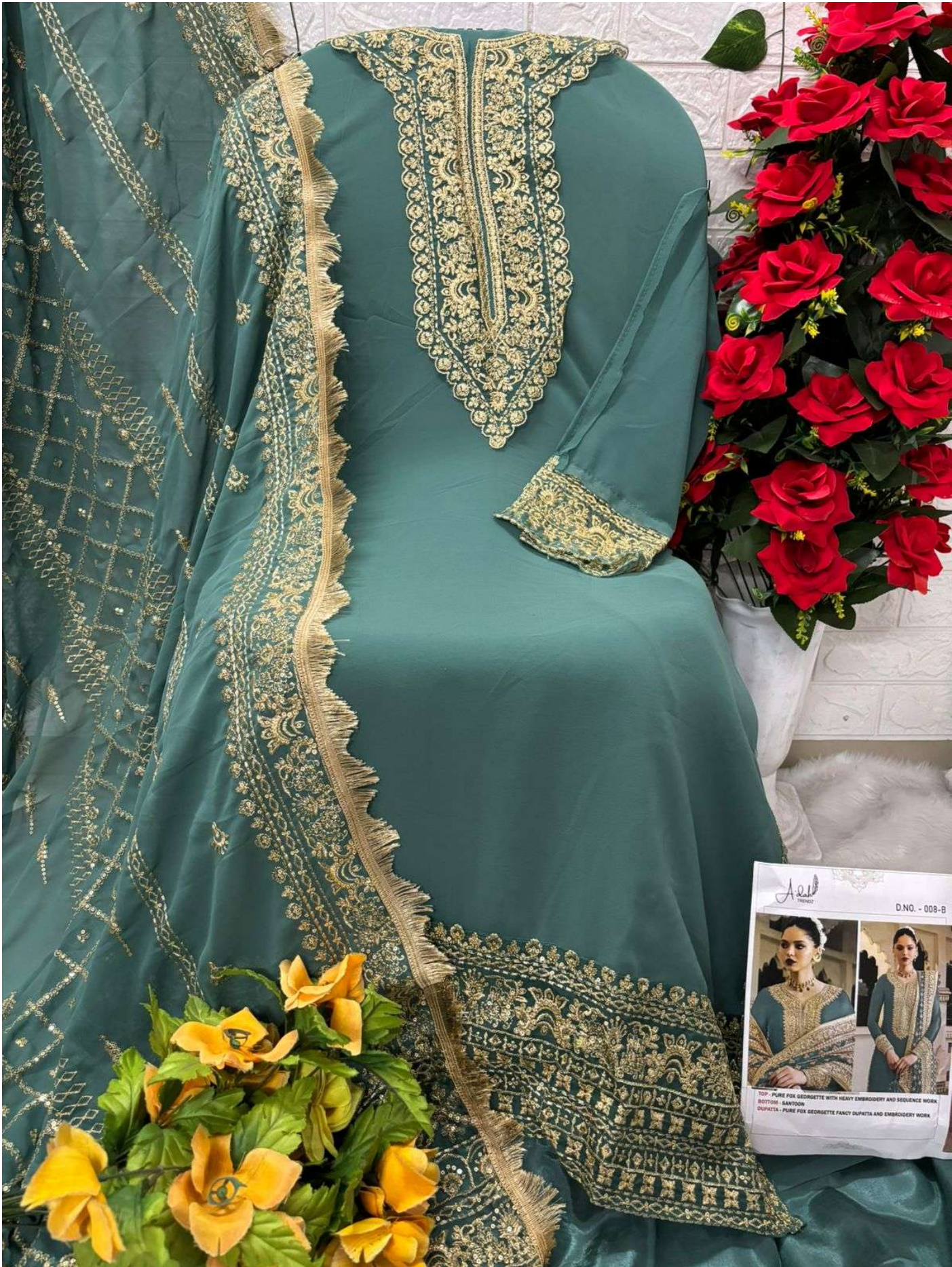
Aest DESIGN D.NO. - 008-B TOP - PURE FOX GEORGETTE WITH HEAVY EMBROIDERY AND SEQUENCE WORK BOTTOM - SANTOON DUPATTA - PURE FOX GEORGETTE FANCY DUPATTA AND EMBROIDERY WORK