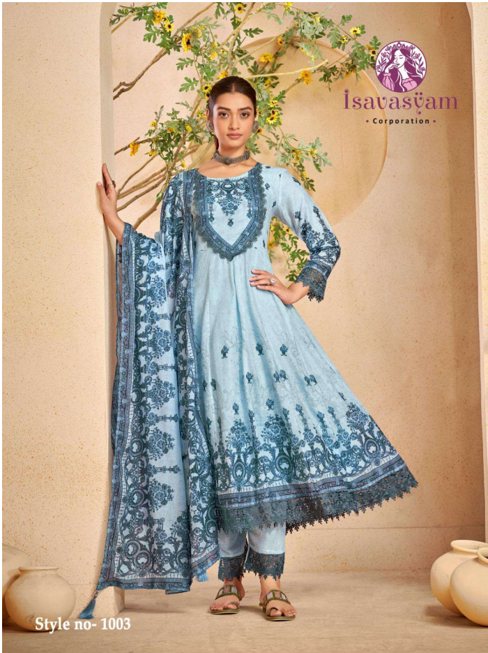
Style no- 1003