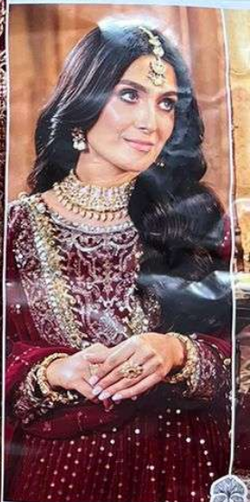
CHANTELLE Vol-10 ZAH TOP Butterfly net with Embroidery BOTTOM INNER Dull Santoon DUPATTA Butterfly net with Embroidery