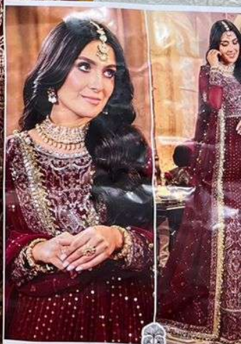
CHANTELLE ZAHA D.NC Vol-10 TOP Butterfly net with Embroidery BOTTOM INNER Dull Satton DUPATTA Butterfly net with Embroidery