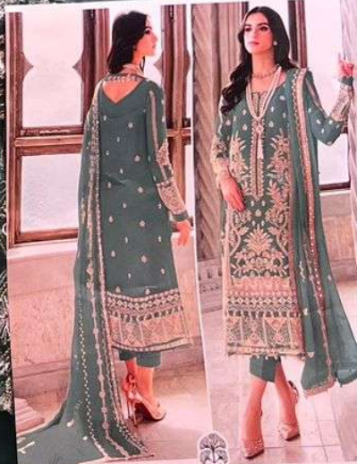
GULAL ZAHA D.No. 10 TOP: Lux Georgette with embroidery BOTTOM-INNER: Dull santoon