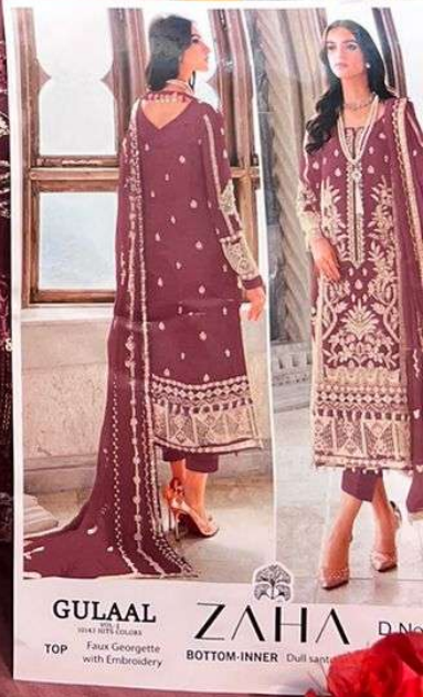
GULAAL D.No TOP Faux Georgette with Embroidery ZAHA D.No BOTTOM-INNER Dull kano