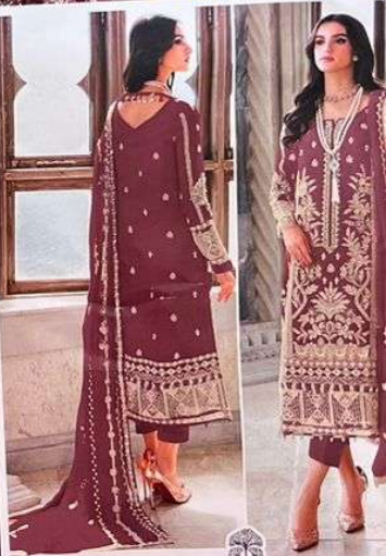
GULAAL D.No 2024 NEW COLORS ZAHA D.No TOP Fauz Georgette with Embroidery BOTTOM-INNER DUFPA