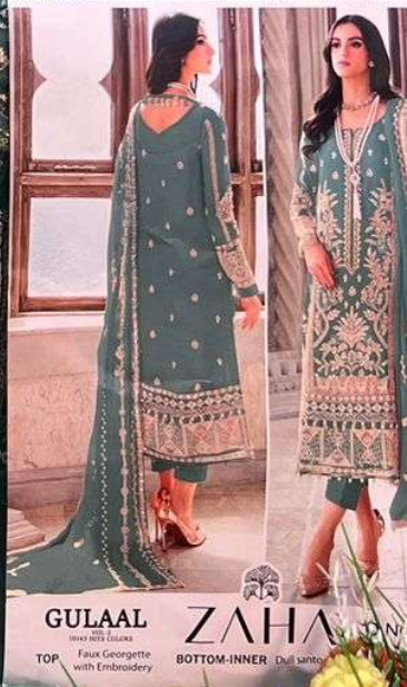
GULAAL 100% Faux Georgette TOP with Embroidery ZAHARA Dress with Embroidery BOTTOM-INNER Dull satin