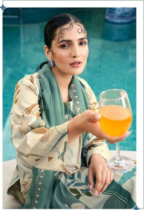
Embracing the timeless beauty of ethnic wear, I feel connected to my roots and my culture.