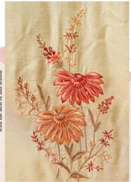
Experience the coolness of the fashion in contrast with the heat of this season