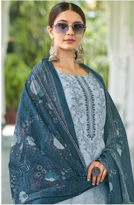
"Culture's Dance, Quality's Grace, Dresses that Beautifully Embrace."