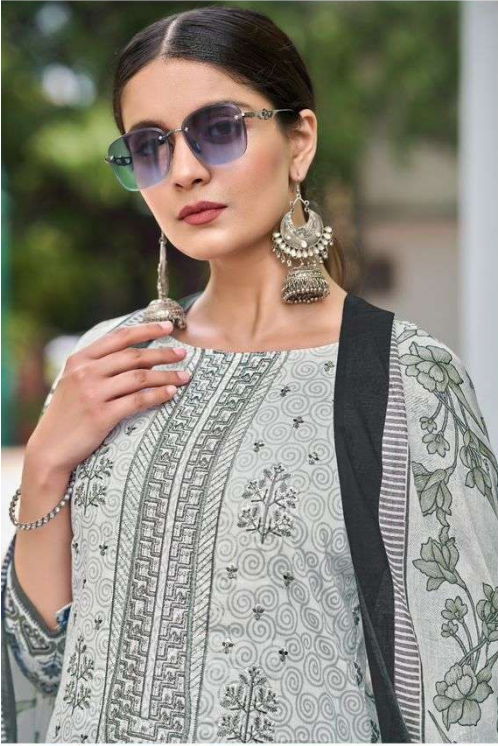
"Cultural Elegance, Quality's Bloom, Dresses that Exude Beauty's Perfume."