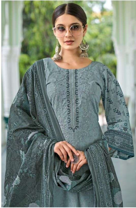
"Fabrics of Grace, Dresses that Embrace - Unveiling Your Radiant Culture."