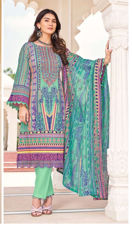
Personal Style ARHAM:4210