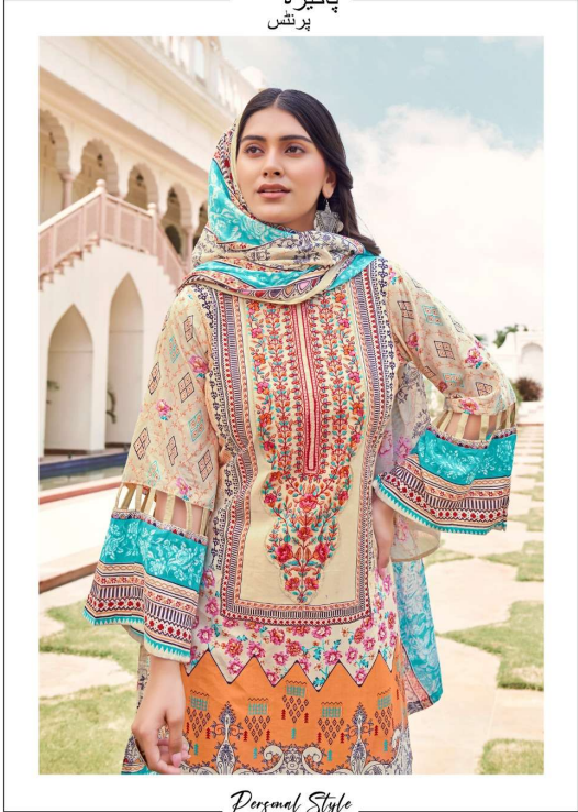
Personal Style ARHAM:4201