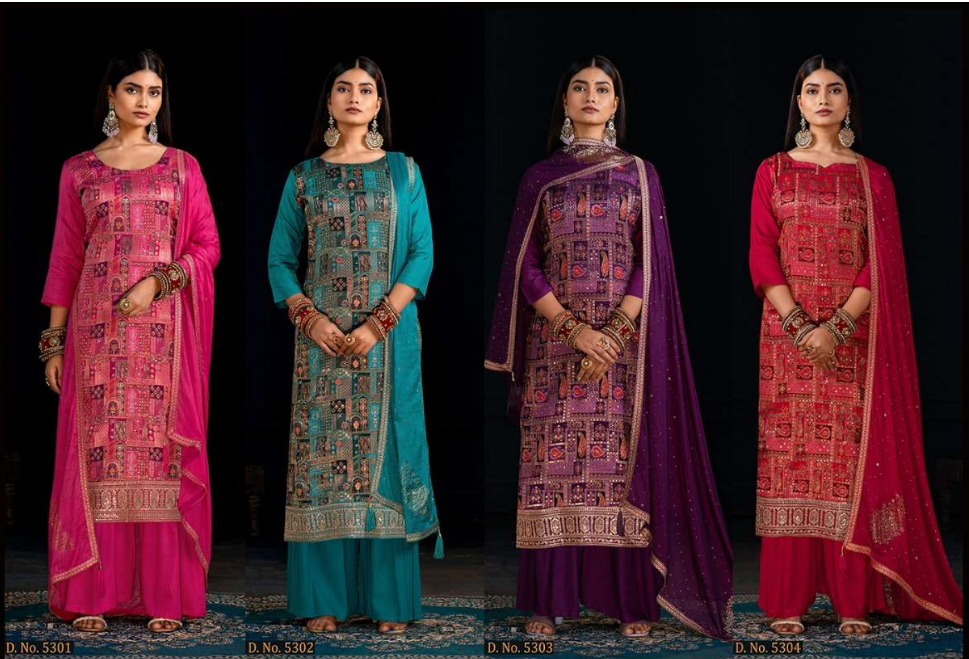
D. No. 5301