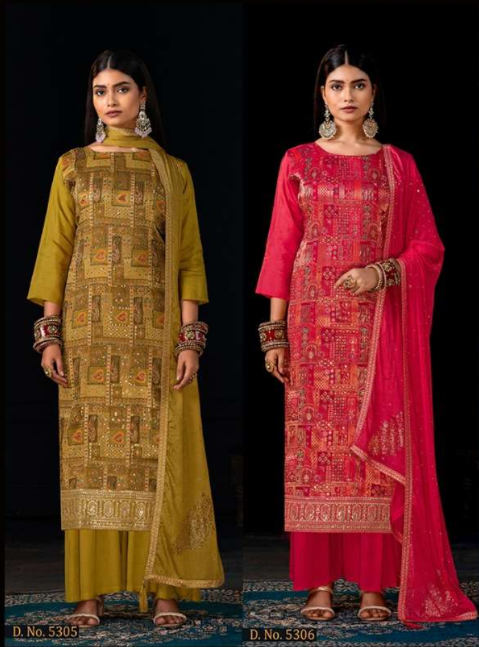
D. No. 5305