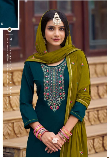
THE SEASON'S LOOK BOOK WITH EXCLUSIVE WEARABLE, THE BEST OF THE SEASON'S TRENDS