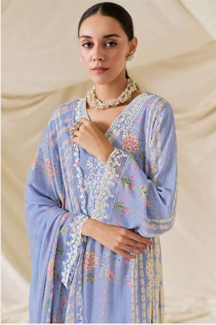
9444 | the promise of flowers in the sand in a vision of white that is over the world of exploration.