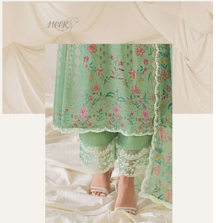
9446 | expressing elegance of that speaks colours about in the same attention to detail is rewarded by presenting you with the finest one.