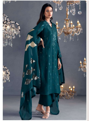
— 2164 —