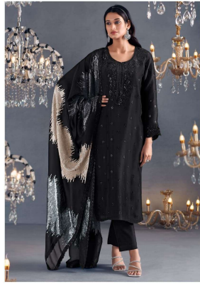
— 2162 —