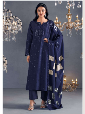
— 2168 —