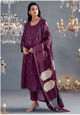
— 2161 —