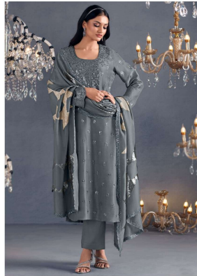
— 2166 —