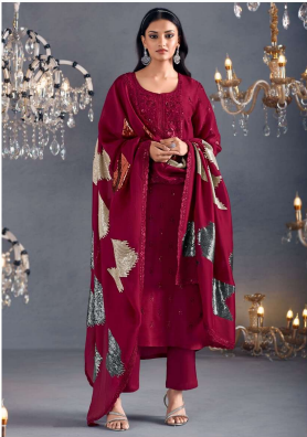
— 2165 —