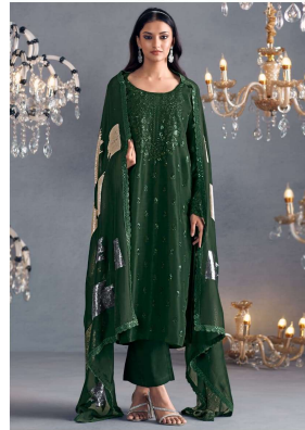
— 2167 —