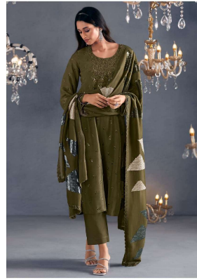
— 2163 —