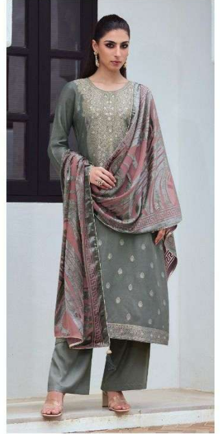
D.No : 61004