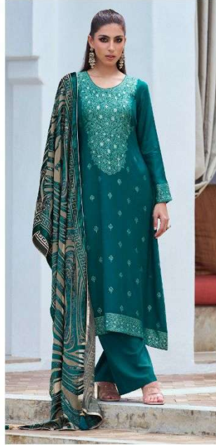
D.No : 61002