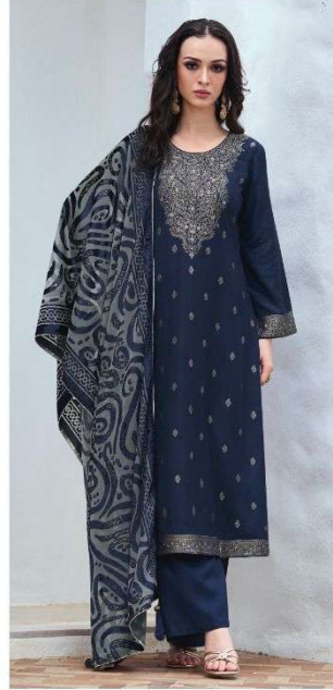
D.No : 61003