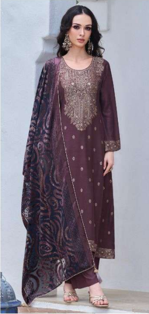
D.No : 61001