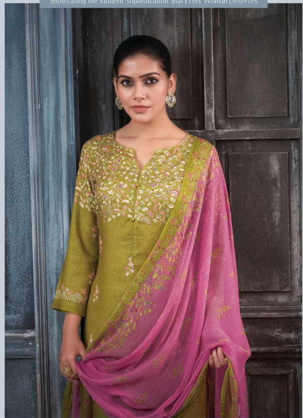
Our Ethnic Dresses Offer a Graceful Nod to Tradition While Showcasing the Modern Sophistication That Every Woman Deserves