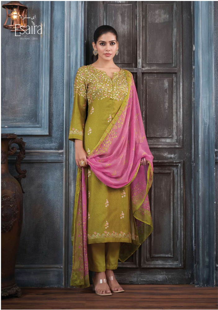
Our Ethnic Dresses Offer a Graceful Nod to Tradition While Showcasing the Modern Sophistication That Every Woman Deserves