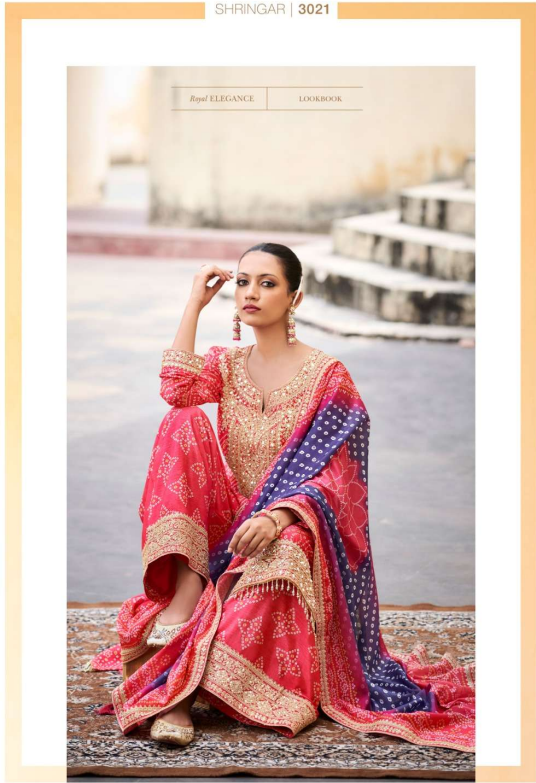
Crafted with the latest designs and AMAZING COLOR combinations, THIS COLLECTION will make you fall for it.