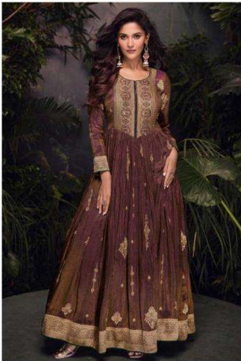
D NO : 5722