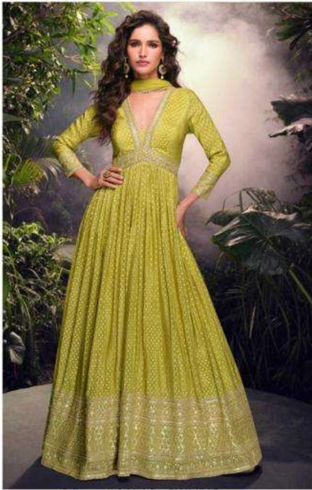
D NO : 5720