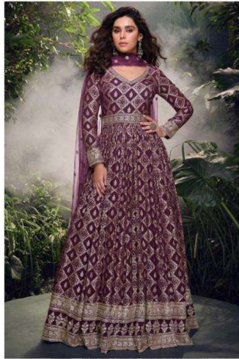
D NO : 5721