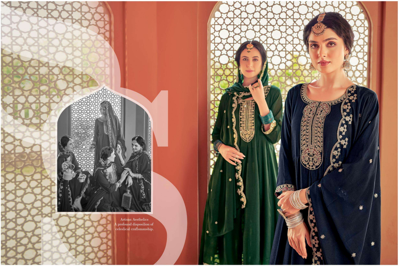
Artisan Aesthetics A profound disposition of celestial craftsmanship.