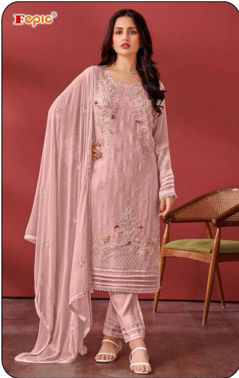
C - 1665 G

Rosemeen® Styled for your comfort by Fepic