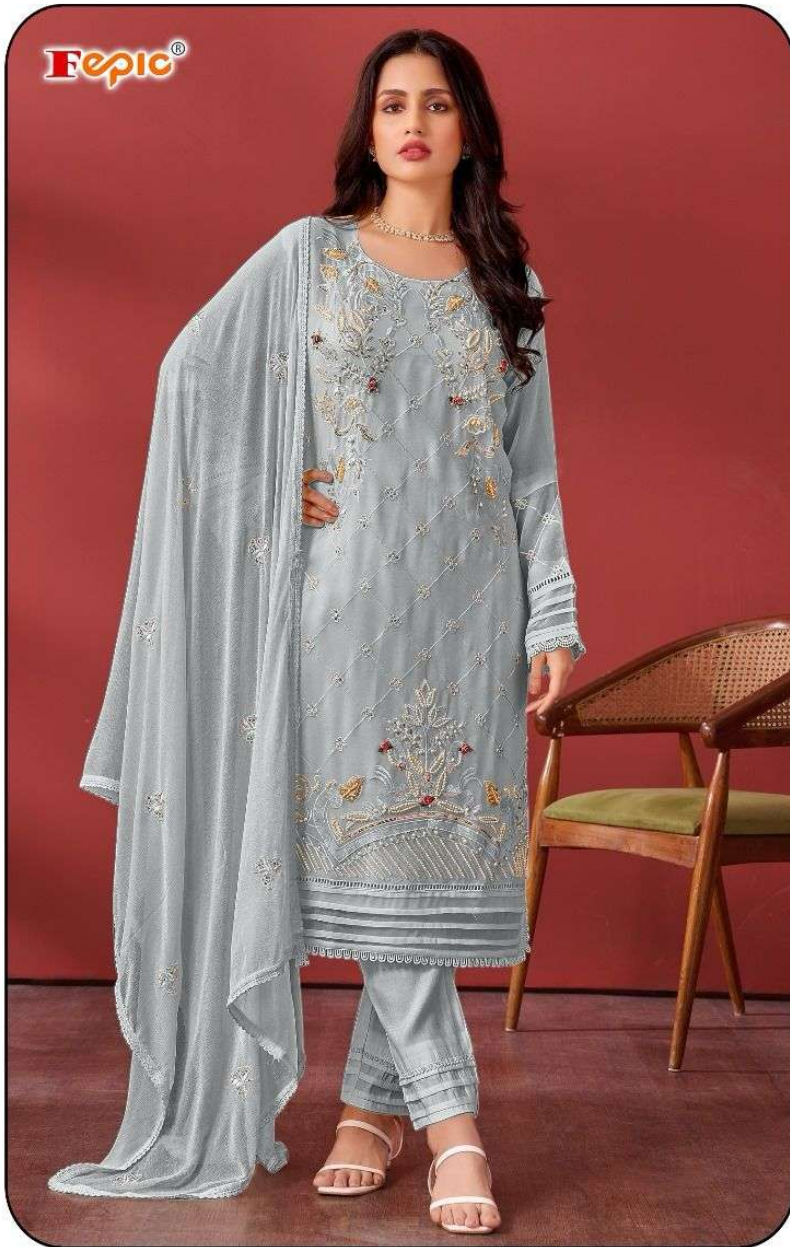
C - 1665 F