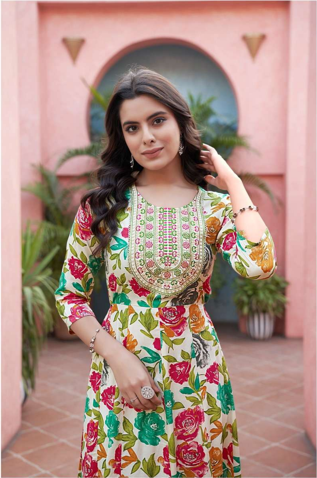
Keeping it classy with a touch of traditiona