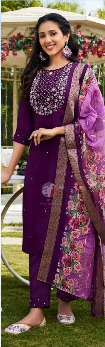
Ghunghat VOL-12 4101