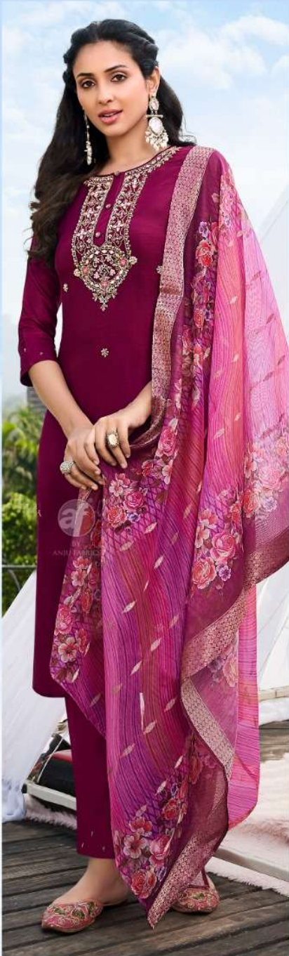
Ghunghat VOL-12 4104