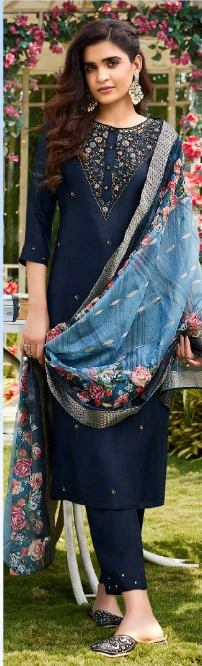
Ghunghat VOL-12 4105