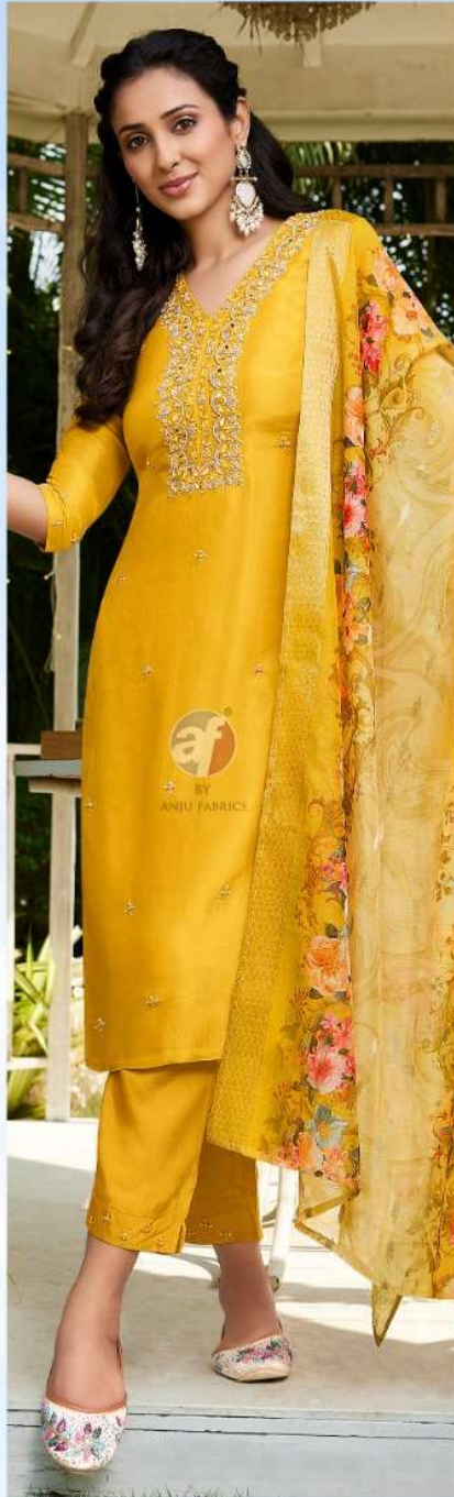
Ghunghat VOL-12 4102