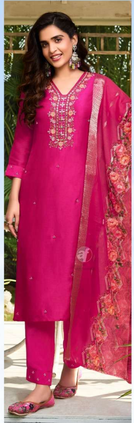
Ghunghat VOL-12 4105