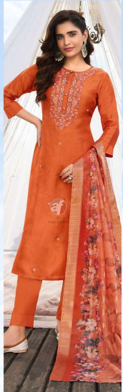
Ghunghat VOL-12 4103